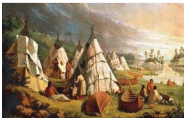
Graphic 3. Sample Stereotypical Depictions of Indigenous Peoples and Homes

includes stereotypical illustrations of Native peoples, homes, and regalia in a variety of educational materials. Examples of such depictions are below: